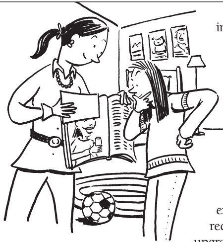
image the company is portraying (example: "Good-looking and popular people drink our soda").

Activity: Cover up brand names in ads. See if your middle grader can guess what they're selling. She may be surprised by how much they focus on attractive models or funny situations rather than on the products. Ask her what